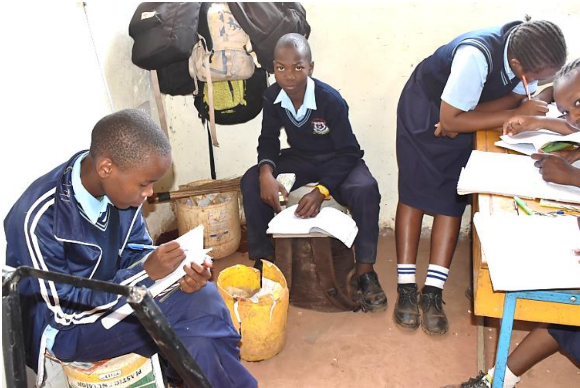
Lacking desks and benches in grade 9