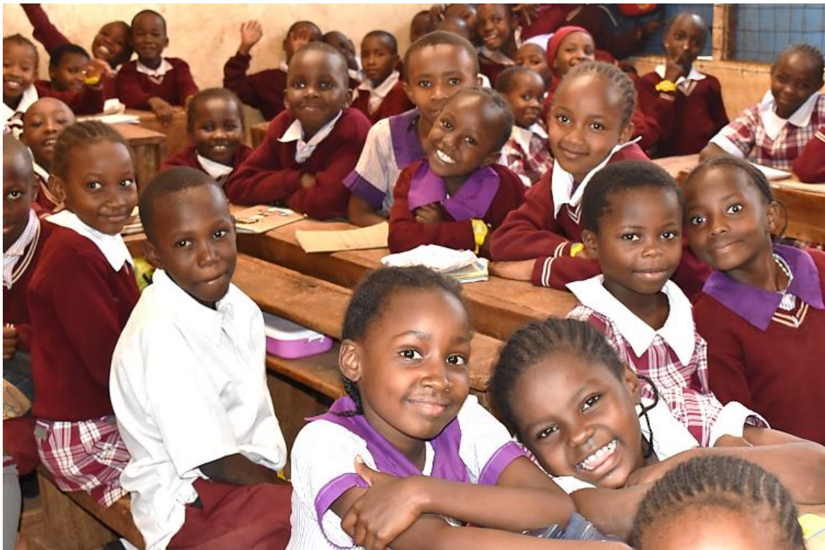
Happy faces in spite of crowded classrooms in grade 3